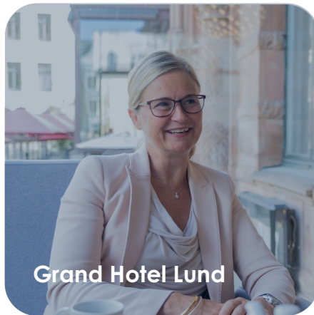
Grand Hotel Lund